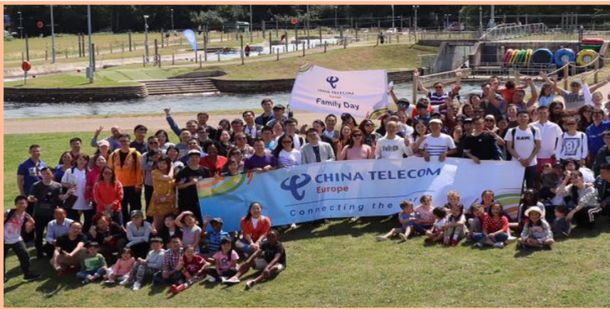
London colleagues and their families enjoying the second CTE Company Family Day

They also joined in more adventurous activities such as riding the rapids and mountain biking. A photography competition attracted participants of all ages, encouraging them to be more mindful and record every second.