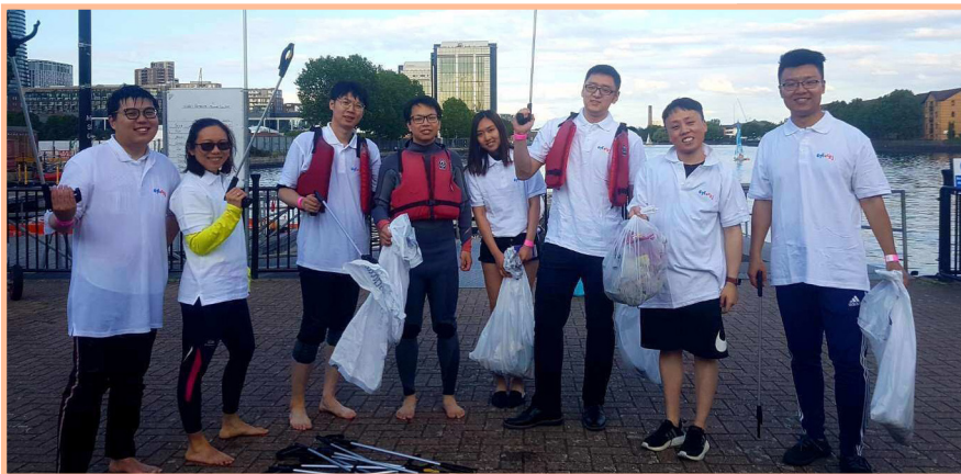
The CTE London crew celebrating their successful river clean up

This year, 26 employees led by the CTE management team used litter pickers and nets to collect and clear a total of eight bags of rubbish, weighing around 5.1 kg.