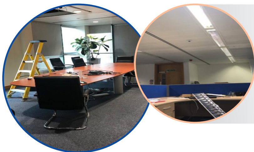
Installing new energy saving lighting systems in CTE's London offices